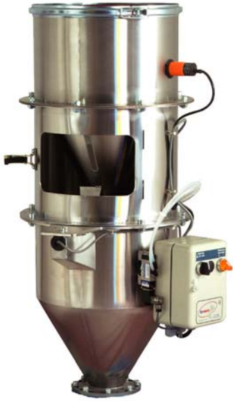
25 Liter weight hopper